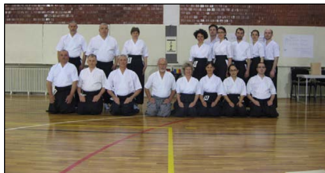
National seminar, Bucharest, Romania, April 2013